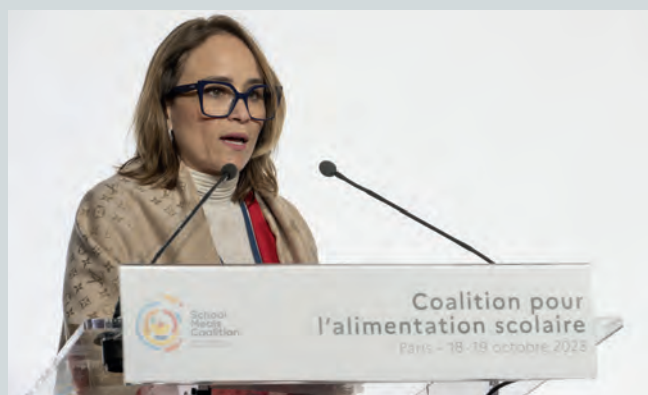
Fernanda Pacobahyba , Vice-Minister of Education, Brazil