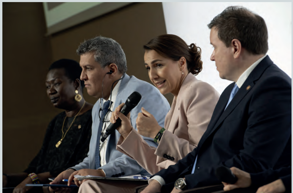
Panelists from left to right: Awut Deng Acuil , Minister of Education, South Sudan / Musa Mohammed Almagrif , Minister of Education, Libya / Mariam Almheiri , Minister of Climate, United Arab Emirates / Ville Tavio , Minister for Foreign Trade and Development, Finland