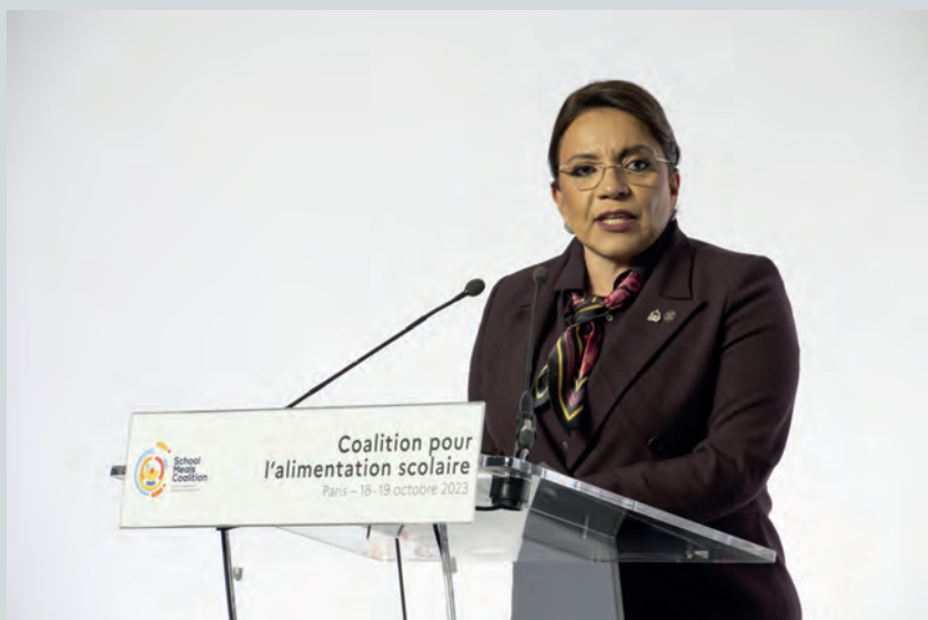
H.E. Xiomara Castro Sarmiento, President of the Republic of Honduras

At the Summit, 35 countries shared their progress so far and announced new commitments as part of the Coalition's efforts to reach 720 million primary school age children worldwide. Currently, 34 Countries have submitted their national commitments to the Coalition to expand and invest in school meals programmes, with their strategies for advancing national commitments in their respective contexts. There was a strong call for Coalition members and leaders to support each other in achieving these commitments. The interventions demonstrated that the Coalition is powered by national leadership and ambitions.