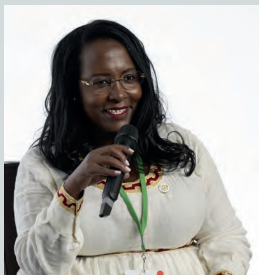
Adanech Abiebie , Mayor of Addis Ababa, Ethiopia