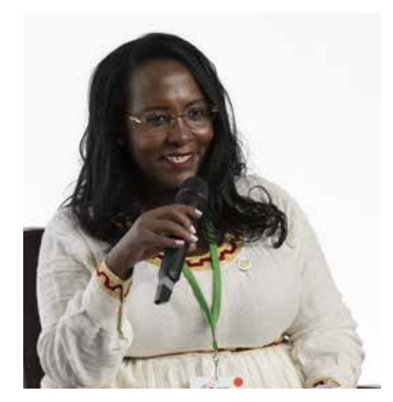
Adanech Abiebie, Mayor of Addis Ababa, Ethiopia